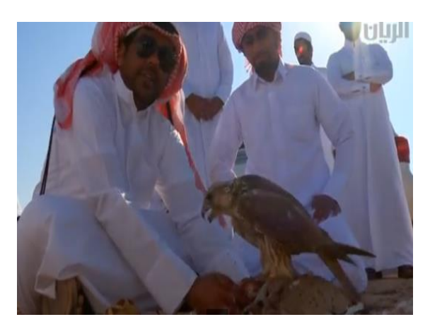
Figure 2. A Photo Captured from the Program of the Winning Falcon Eating Its Prey

While the sagara trains the falcon to catch a prey, the sagar throws a prey on the air and hoping that the trained falcon would be able to catch it while both are flying. The program offers a thrilling background