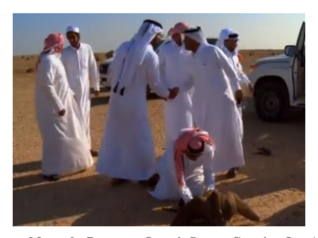
Figure 1. A Photo Captured from the Program, Qataris Sagara Greeting One Another for the Blissful Hunt

The program points to "Madena Al-Shamal" in Qatar to be the most important city for those who practice falconry, as an established natural community by the locals not by the law. In al-Shamal, for some Qataris the landscape seems prepared for falconry, several equipment spread everywhere, and the modern cars in the desert presents the strong traditional intention of occupying desert and practice desert activities in modern times. The program shows Qatari individuals stay for quite long time in the desert to train their falcons.