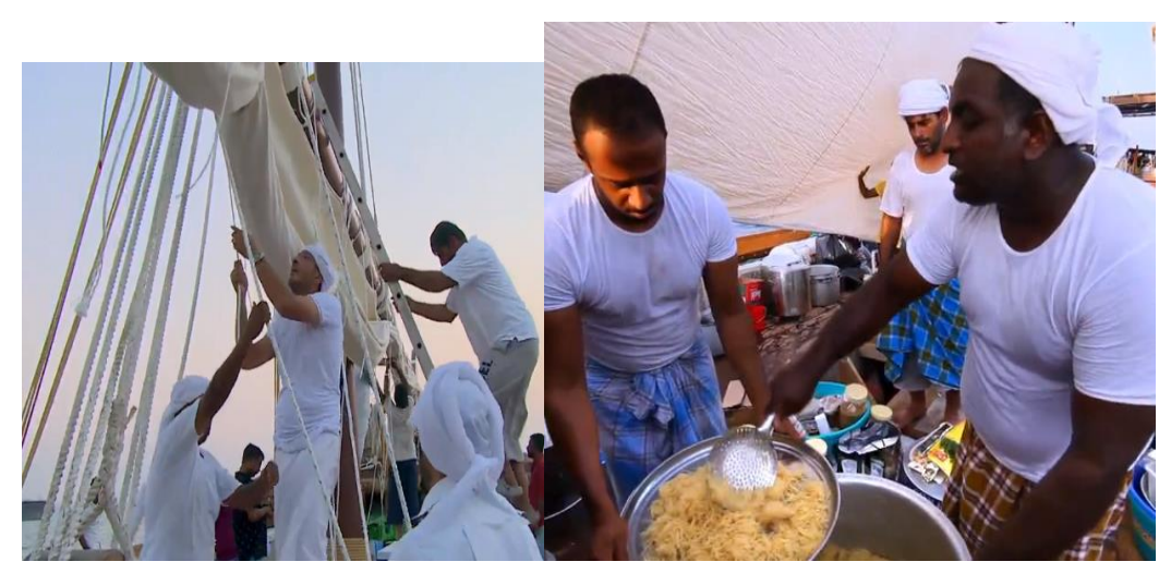
Figure 12. Collection of Captured Photos from Fatah Al-Khair Program