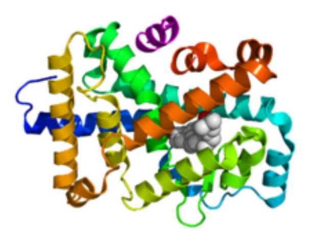
Figure 3: Crystallographic structure of the ligand binding domain of the human ROR \gamma (rainbow colored, N-terminus = blue, C-terminus = red) complexed with 25-hydroxycholesterol (space-filling model (carbon = white, oxygen = red) and the NCOA2 coactivator (magneta).

A heterodimer complex is formed between thyroid receptor and retinoid X receptor (RXR), this complex is capable to alter the gene expression by stimulating or repressing the gene transcription after binding onto a specific DNA sequences in the target genes. This DNA sequence is referred as thyroid response element (TRE)