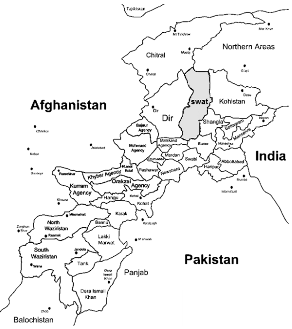
Figure 1: Map of Khyber Pakhtunkhwa, Pakistan and its neighbor countries. The "shaded area" shows study area.

Pakistan is located in the western part of the Indian subcontinent, with Afghanistan and Iran to the west, India to the east, the Arabian Sea to the south and covers an area of approximately 796,095 sq. km (figure 1). About 46,8000 sq. km of this area is in west and north comprises mountains lands and plateau, while the remaining 328,000 km<sup>2</sup> is in the form of plains [1]. Pakistan has a diverse communities distributed into variety of ethnic groups, having variety of cultures, languages and geographical backgrounds, which make this land suitable for unraveling early human migrations, population study and evolutionary history having 18 ethnic groups further divided into casts and sub-casts [2,3].