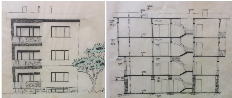
Fig. 5. South façade and section drawing of the Apartment.

Interestingly, while a bathtub has been seen in the plan, it was not installed during the construction. Yusuf Akdamar talks about this issue, " ...there was a copper boiler/thermosiphon and a marble basin (kurna) in the bathroom ". So, it is understood that the use of the bathtub is still not widespread in those years.