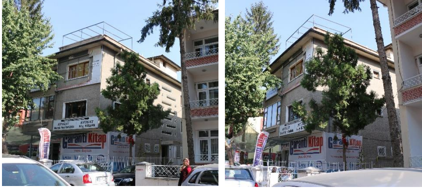
Fig. 1. The views of Akdamar Apartment from Boylar Street.

The Akdamar Apartment as a family house, located in Sahabiye Neighborhood on Boylar Street, was designed by civil engineer Kamil Kundakçiođlu in 1965, with modern planning considerations, construction materials, and systems. (See Fig.1)