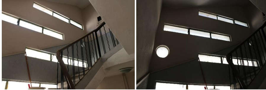
Fig. 4. Photos of stair hall.

With its 144 square meters (9x16m) area in each floor, it is one of the biggest apartments on Boylar Street. Total height of the apartment is 11 m built with reinforced concrete. As seen at the section drawing, the flat roof was also new in those years (See Fig. 5). The apartment's heating system was provided by stove, and a radiator was added in the 2000's. Tiles and mosaics as finishing materials were used in wet spaces like bathrooms, toilets, and kitchens, while wood parquet on the floor was proposed in the main rooms like the dining room, living room and guest room. While describing their home, he continues, " Our guest room was a room with luxurious services such as a sofa set that was not used much. It was only open for celebrations and special guests ". Despite the fact that this family apartment's plan is different from the traditional houses in Kayseri, the guest room is simply connected with the entry hall and living room and does not let guests enter the main living room. It means that the traditional privacy concept still continued in the plan level in those years.