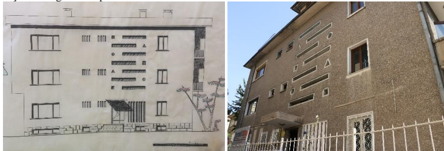
Fig. 3. A drawing of original West façade and a photo of current situation.

Yusuf Akdamar also added that “our apartment was different from the other apartments on Boylar Street. There was a unique main entrance façade designed with different geometric shapes – triangle, square, and circular windows that allowed sunlight to penetrate into the stairs inside”. (See Fig. 4) This information can be seen in Figure 3, which shows a drawing of the original façade design and a photo from the current situation.