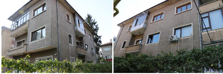
Fig. 6. Views of the Akdamar Apartment.

As a general review, the apartment differs from the traditional house in the plans, building material, and construction technology. It also reflects the geometric system of modern architecture. (See Fig.6)