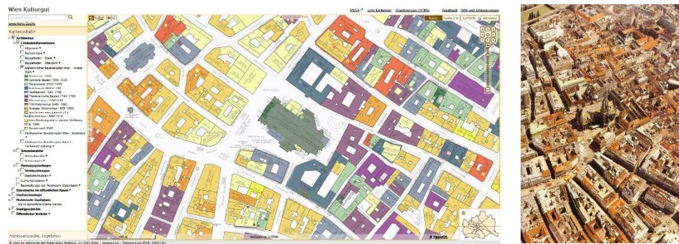
Fig. 3. Kulturgut Wien - interactive public cultural heritage database : The civil society gains open access to manifold information about its cultural heritage – protection status, building type and period, war damage, material and construction and physical condition etc. (Source: www.wien.gv.at/stadtentwicklung/grundlagen/schutzzonen ).

The new method now distinguishes between fully protected structures (Schutzobjekte), essentially protected structures (Schonobjekte) and non-protected structures . All inspection data are computerized in form of an cultural heritage database, implanted into the geo-information system (GIS) and processed in form of an open-source multi-purpose city map plus database, electronically accessible for everybody under Kulturgut Wien. The cultural (and natural) heritage map and the affiliated database inform the civil society as well as the authorities and scientists about monument protection issues, the building periods, building types, construction and material, other cultural values, their current physical condition and overcome damages like the one from World War II.