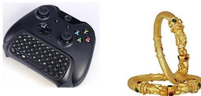
Fig. 2. Disfunctional and complex display and control buttons, jewels from plastic.