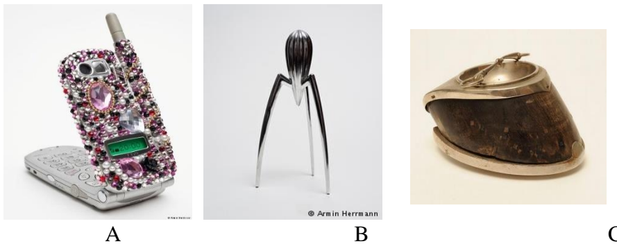
Fig. 3: A: Everybody needs a glittering, jewel encrusted cell, B: Functional lies: Philippe Starck's iconic but useless lemon juicer, C: Horse's hoof ash tray

Kitsch is a German term used to classify and express art, which is a duplicate of an existing style. This term is also used to refer to banal, rusty, and boring products made with shabby shades and commercial concerns (20). Most kitsch is the result of individuals following their interests, untrammelled by certain design principles. The designer mixes populist forms and basic functions to create the desired result. The value judgment that to do so is “inappropriate” is based upon modernist doctrine. Such was the influence of modernism on design education that its intellectual framework became the yardstick against which design was judged “good design” on modernist terms became considered “good taste” and hence kitsch was regarded “bad taste”. Since the 1980’s, designers have mixed the emotional and poetic possibilities that emerged from postmodern theory with the common sense aspect of modernism to establish broader boundaries for appropriate aesthetics. While the arbitrary nature of kitsch is still condemned. Designers have learned from its playfulness. The black and white opposites of kitsch and modernism have been augmented by a third way where appropriate form can be defined via poetic as well as