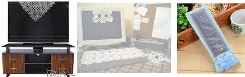
Fig. 4. Kitsch fragments are every where in eastern lifes.

The cultural environment and atmosphere that the design serves serve a natural structure that brings together the product quality and the expectation level from the products. the economic status of the society, besides education and cultural structure, determines the design quality and preferences. In this respect, countries in the developing countries class can easily find themselves in bad design and kitsch. Even though the quality expectation level of the users is higher than the products, the economic conditions can be seen as an obstacle to achieving good design. Good quality and good designs are positioned with high price range in capitalist market place. This leads to confusion as the product supports bad design and widespread kitsch specimens in eastern countries.