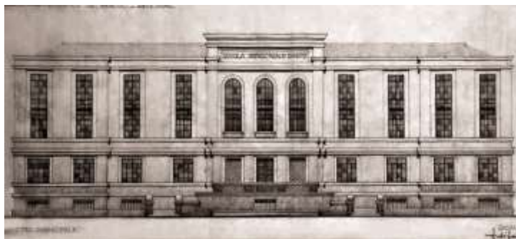
Fig. 108. Industrial School, Shkoder

The King, once ascended to the throne, ask also to cover the balls decoration of the salon, the decoration of which will be faced by the Italian government entirely as a sign of