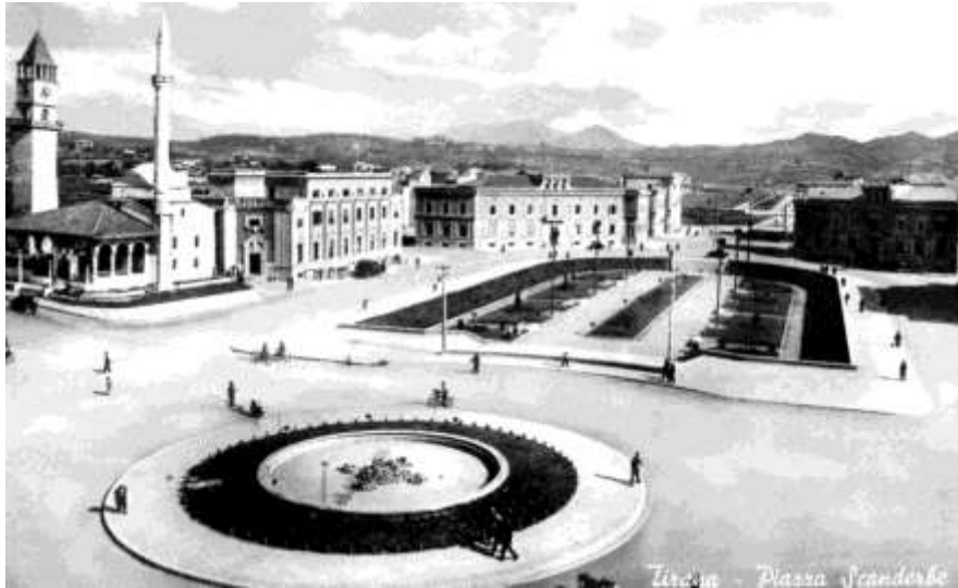
Fig. 31. Skanderbeg square, 1936

As evidenced in the legend in one of the papers of the Regulatory Plan, which is available in the central Technical Archives Building in Tirana, where are clearly specified the areas in which worked each of the three projectors. The new Skanderbeg Square together with ministries was entirely conceived by architect Florestano Di Fausto. The Square were re-proposed again, after a host attempts, in an eclipse form, different from the one proposed by Brazini. This time perfectly integrated with the existing nucleus of the Old Bazaar above all in complete sync with the presence of the Ethem Bey Mosque, important religious building in the historical memory of the peoples and certainly with great religious value and of particular oriental architectural although in modest dimensions.