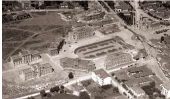
Fig. 75. Skanderbeg square, 1936

With great skill Di Fausto managed to create a strong relationship between the new vision of space and the existing city, above all from Ethem Bey Mosque and the parliament buildings (today Puppet Theatre), defining ministerial complex in terms of volumes. Heights of buildings contained lines that derive from the mosque where the volume view levels can distinguish clear correspondence between layers and the volume between the dome and pull of the upper ministries. Maybe even for economic reasons, the buildings were designed with modest height and thus not bring a sudden change of scale between new and complex fabric of the existing city. This care was well combined with already consolidated image of the mosque, the old bazaar and the City itself, although the eclectic architecture proposed did produced later the new monumental urban characters, quite different from the context of strong Oriental character. [8]