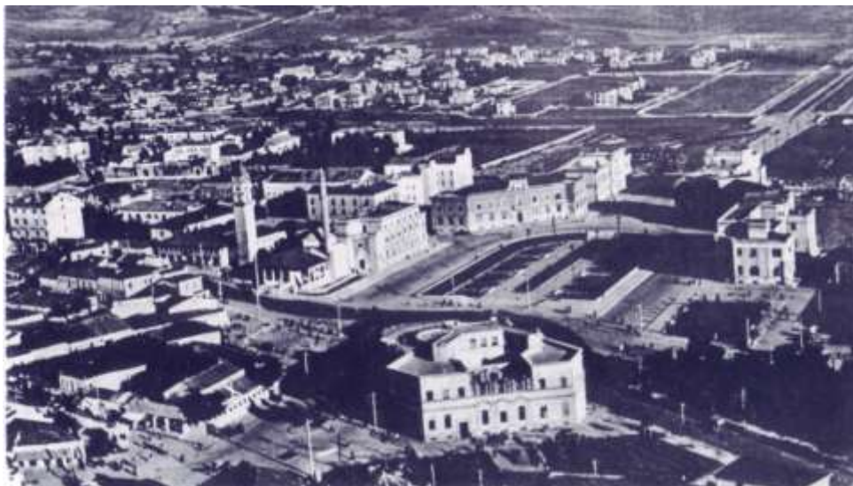
Fig. 20. Skenderbeg square, 1936

Florestano Di Fausto [7] in cooperation with the governor and ambassador Mario Lago since 1923 did built in Rodi and other centers of Greek Dodecanese island a large number of objects for government institutions and after the instructions from King Zog he began with the design and implementation of the ministerial buildings.