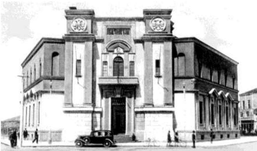
Fig. 42. Tirana Municipality Building, 1928-30 (Archive of Marubi)

As evidenced in the legend in one of the papers of the Regulatory Plan, which is available in the central Technical Archives Building in Tirana, where are clearly specified the areas in which worked each of the three projectors. The new Skanderbeg Square together with ministries was entirely conceived by architect Florestano Di Fausto. The Square were re-proposed again, after a host attempts, in an eclipse form, different from the one proposed by Brazini. This time perfectly integrated with the existing nucleus of the Old Bazaar above all in complete sync with the presence of the Ethem Bey Mosque, important religious building in the historical memory of the peoples and certainly with great religious value and of particular oriental architectural although in modest dimensions.