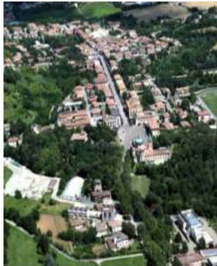
Fig. 2. Predapio Center designed by Di Fausto, Italy

Di Fausto [1], with his interventions in the Italian North African colonies, is considered also today as one of the main architects of "Overseas Architecture" for that period. Thanks to a considerable preparation, Di Fausto [2], [3], [4] is an almost overwhelming pattern of a professional architect who was able to master and use regardless of geographic context,