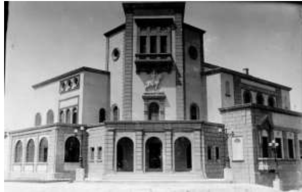
Fig. 4. Royal villas in Durres, 1928

After his arrival in Albania, Di Fausto took an important task from King Zog, to design the ensemble of ministries and administrative and cultural buildings in Skanderbeg Square. In addition, King Zog did requests the design of the Royal Palace in Durres (1928-1930), originally designed by Brazini, re-proposed and built by the Albanian architect Christos Sotiris, design and construction of the Royal Villa in Shiroke [5], the