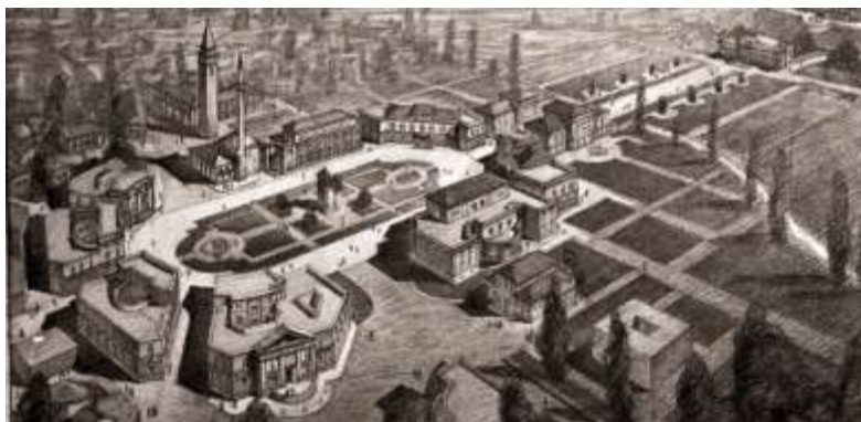
Fig. 86. Skanderbeg square, 1930

With great skill Di Fausto managed to create a strong relationship between the new vision of space and the existing city, above all from Ethem Bey Mosque and the parliament buildings (today Puppet Theatre), defining ministerial complex in terms of volumes. Heights of buildings contained lines that derive from the mosque where the volume view levels can distinguish clear correspondence between layers and the volume between the dome and pull of the upper ministries. Maybe even for economic reasons, the buildings were designed with modest height and thus not bring a sudden change of scale between new and complex fabric of the existing city. This care was well combined with already consolidated image of the mosque, the old bazaar and the City itself, although the eclectic architecture proposed did produced later the new monumental urban characters, quite different from the context of strong Oriental character. [8]