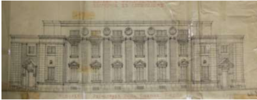
Fig. 97. Ministerial building in Skanderbeg square, 1930 (Archiv of Florestano Di Fausto)

In this monumental plant were present some citations from the Predapio and Rhodes plan and many points in the same linguistic and architectural in which Di Fausto was working simultaneously. By drawing an urban sign of the eclectic matrix, chasing through centuries in the Italian history of architecture, ranging from Roman architecture, continuing through the Renaissance, in a context of dialogues already seen, the landscape background communicate with the built environment as in Predapio. New expressive Centre of Tirana become the new square surrounded by institutional buildings type, which put on the organization of ministries of infinite boulevard in a refined game of territory control. This organization, which was visual and spatial wanted to make the politico-administrative difference initially from the urban point of view with this new plan.