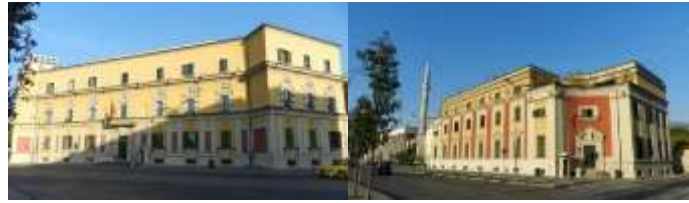
Fig. 53. Ministerial building, 1928-30 ((A.Vokshi)