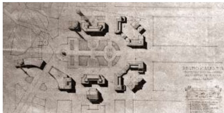
Fig. 7. Skanderbeg square, the second variant designed by Di Fausto, 1928 building of the Italian Industrial School in Shkodra and in 1935 to designed the Royal Palace in Tirana. [6]