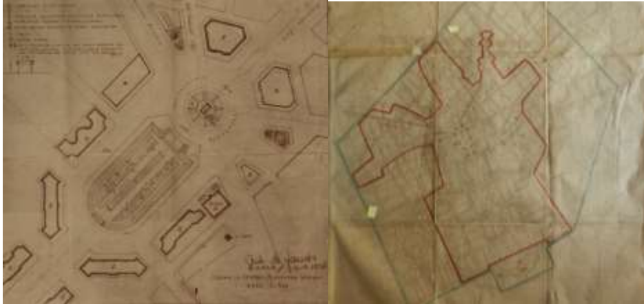
Fig. 8. Skenderbeg square, last variant designed by Di Fausto, 1936

Naturally, the most important part of his work was the government buildings in Tirana. On 20 January 1929, the king made the decision to trust Di Fausto the project for these important public buildings. By replacing Brazini, Di Fausto worked alongside with the Austrian architect Koler and Albanian engineer will deal with the design of the main square and the boulevard in some parts of it.