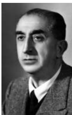
Fig. 1. Florestano Di Fausto

In 1927-28 for the proposals made to the new plan, King Zog asked to the Italian government the intervention of another Italian architect who will contribute to the Regulatory Plan of Tirana, especially in the architectural part of the governmental objects with significant impact. This time Mussolini proposed Florestano Di Faustos, another architect from Rome very appreciated by him, especially for the work done in Predapio, hometown of Duce.