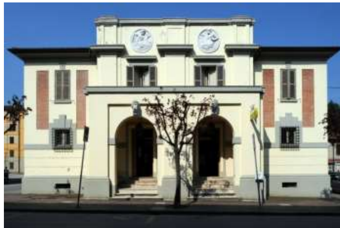
Fig. 3. The building designed by Di Fausto in the center of Predapio, Italy (A.Vokshi)

all styles, from "moresk" to "Venetian Gothic", the "Renaissance" to "Novecento", following up and rationalistic architectural language to another "modern style". Out of prejudice to the formal results achieved what is important to say, is a special report analyzing the view that this category of architects manages to transform the architecture in relation with the place where will be built and with the function that will perform.