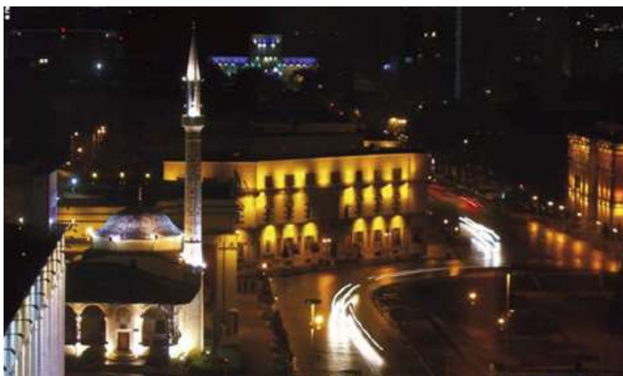
Fig. 22. Di Fausto buildings in our days. (A.Vokshi)

Di Fausto was an architect who moved in an area bordered by the remote extremes of eclecticism and the new language of architecture. Although using traditional and eclectic architecture, he mixed them in a sophisticated language of modern architecture, adapted to urban situations.