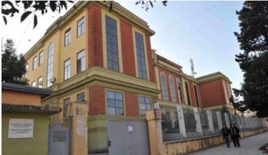
Fig. 119. Industrial School, Shkoder (A.Vokshi)

gratitude. Di Fausto conceived the outside of the villa with a quite different style from the previous architects, transforming the fighter image in an eclecticism simplified and almost devoid of decorations. Construction defects, evidenced by the 1927 earthquake had damaged the central tower, revealed the lack of proper foundations of the building, which stood on a clay soil with high risk of sliding in the sea direction. In fact, the tower changed its appearance on the Di Fausto draft, becoming a central element in almost complete with a three window lintel and a small balcony. The basis part of this, the language of firing openings with round arches as in previous projects. [9]