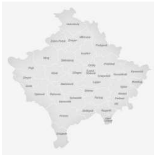
Fig.1. Map with the municipalities in the Republic of Kosovo

Based on this Accord, Kosovo passed the Law on Local Self-Governance, Law on Administrative Municipal Boundaries and the Law on Local Government Finance. Meanwhile the Inter-ministerial Group on Decentralisation is established as responsible body for coordinating the policies and actions for the establishment of the new municipalities and the implementation of the decentralization in the Republic of Kosovo, with the tasks and responsibilities defined under the Government's Decision No. 04/14 dated 3 April 2008. By the chairperson's request, the IGD could invite in its meetings additional representatives of central institutions, elected representatives of municipalities and other persons that could provide advice or that could be relevant to the matters tackled, as well as international representatives from the technical assistance projects in the capacity of observers.