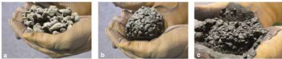
Fig. 5. Samples of pervious concrete with different water contents formed into a ball:

** Laboratory mixtures with flow rates as high as 700 L/m 2 /min have been prepared.