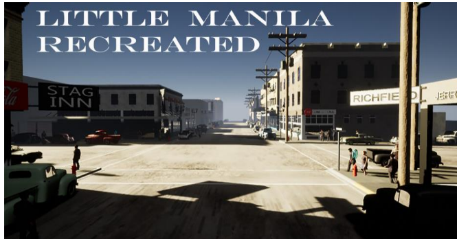
Fig. 1. Example of historical reconstruction. A screenshot of Virtual Reality museum developed by University of the Pacific.

At Harvard University, using Virtual Reality, students in French language and culture classes were able to meet native speakers at parties in their homes and hear conversations in cafes in France, all without leaving their classroom in United States.