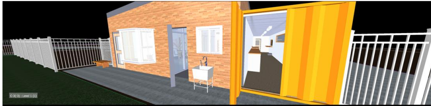
Fig. 5. Example rendering animation video - https://scholarlycommons.pacific.edu/bim_projects/1/ [11]

final reports, timeliner animation videos, rendering animation videos, and zipped VR .exe files.