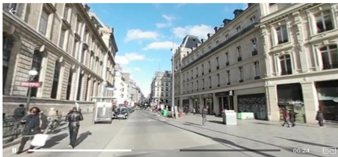
Fig. 2. Example of immersive storytelling. A screenshot from the VR narrative of the La République neighborhood in Paris.

At Harvard University, using Virtual Reality, students in French language and culture classes were able to meet native speakers at parties in their homes and hear conversations in cafes in France, all without leaving their classroom in United States.