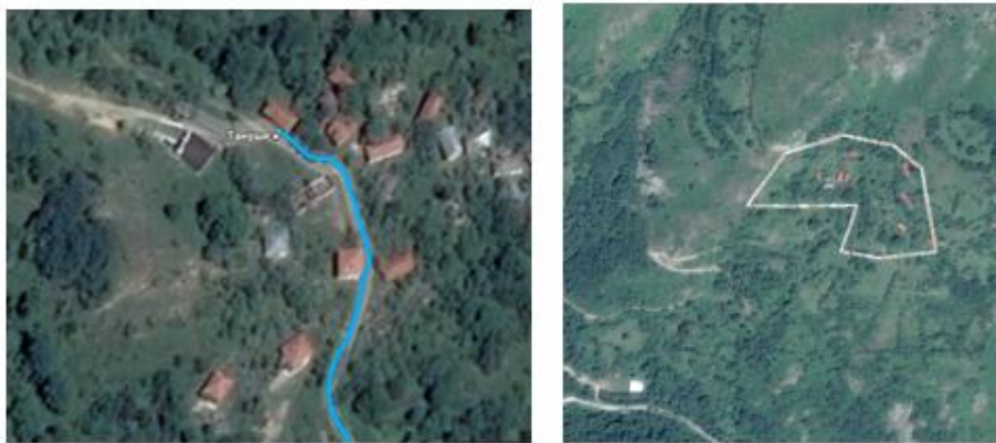
Fig.2. Aerial views of two rural settlements, village Tanushe-Reka and Rimnice (burimi: Google Earth)

Analyzing the characteristic housing unit and its urban surrounding, there is dominant space dedicated family private life (living room, kitchen, sleeping rooms, sanitary...) , while there is also a space dedicated public activities of family in relation with others called “oda e burrave”. Urban surrounding