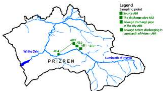
Fig. 1. Presentation of four site-sampling of "AB" on the map of the territory of the Municipality of Prizren

Physical-Chemical characteristics of the Substances Before and After the discharge of factories of the detergents that can cause increase of the degree of the eutrophication of surface waters in the city of Prizren