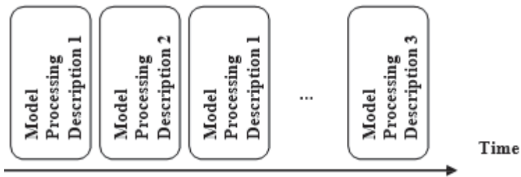
Fig. 1. Illustration of the sequential processing of different sub-model descriptions which performs in total the model processing of a certain system.

System simulation is based on the description of dynamic systems. The solution of this systems are represented by a processing over time. Hybrid dynamic systems are represented by partitioned in different sections where the solution is computed from a sub-model description. This approach is illustrated in Figure 1.