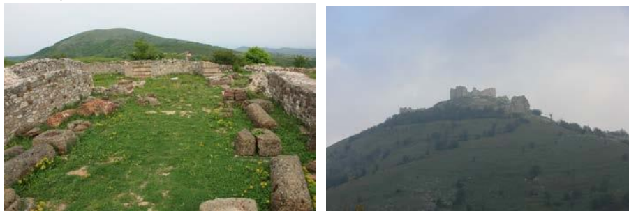
Fig. 7. Novo Bërdo: ruins of the Catholic Church and the fortress of this major medieval mining center of Balkans.

Since 2008, there exists the ICOMOS Charter on Cultural Routes: The new concept ... shows the evolution of ideas with respect to the vision of cultural properties, as well as the growing importance of values related to their setting and territorial scale, and reveals the macrostructure of heritage on different levels. This concept introduces a model for a new ethics of conservation that considers these values as a common heritage that goes beyond national borders, It also helps to illustrate the contemporary social conception of cultural heritage values as a resource for sustainable social and economic development. ... Cultural Routes represent interactive, dynamic, and evolving processes of human intercultural links that reflect the rich diversity of the contributions of different peoples to cultural heritage. [10] With its so-called Saxonian mining towns (Novo Bërdo, Trepça and others), medieval silver mining centers of European dimension, which enabled the living together of mining and trading experts from different nations, religions and cultures, Kosovo provides a nice example for that new concept within the world heritage community.