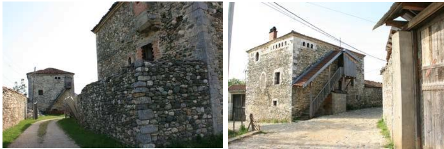
Fig. 5. Cultural Landscape of Dukgjin Kullat in Dranoc (author's photography in May 2015).

the permanent interaction of humankind with nature. Kosovo has in its distinctive building type of the Albanian Kulla not only a good example for a cross-border nomination issue – the Kullat of the south-west of Kosovo extend into the north-east of Albania –, but probably also for a cultural landscape.