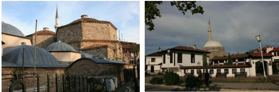
Fig. 4. Prizren, Hammam of Gazi Mehmed Pasha and Building Complex of the League of Prizren (author’s photography in May 2015).

Shukriu, 174 f.] and its built legacy still visible in Prizren are still strong arguments for a heritage inscription of Prizren besides its increasing threat through recent building activities quickly changing the historic city scape.