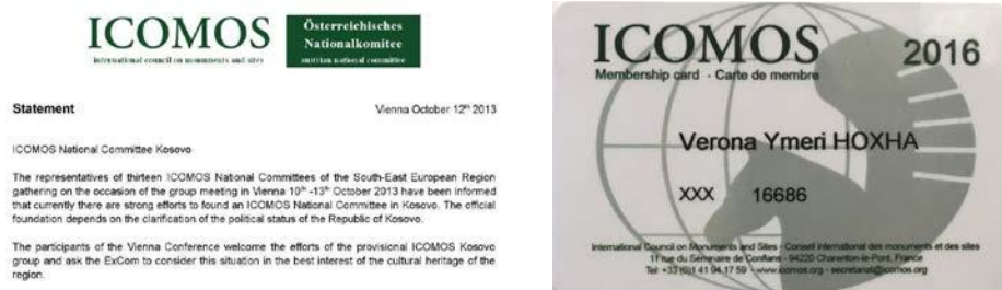
Fig. 2. ICOMOS South East European Region Meeting 2013: Welcome statement to form an ICOMOS group Kosovo; right: ICOMOS Membership card of an international expert from Kosovo, listed as International Expert (xxx) without National Committee behind.

For architects ICOMOS is the adequate Advisory Body to engage in. ICOMOS experts from signatory states of UNESCO are organized in so-called National Committees (NC) . If the state is not (yet) State Party like Kosovo, its experts still can become international ICOMOS members. With the UNESCO membership of the national state its experts listed in Paris by nationality will automatically form a NC with full voting mandate in the General Assembly. Therefore, the participants of the group meeting of the ICOMOS NCs of the South East European Region in Vienna 2013 welcomed already the author's efforts to form an ICOMOS group Kosovo.