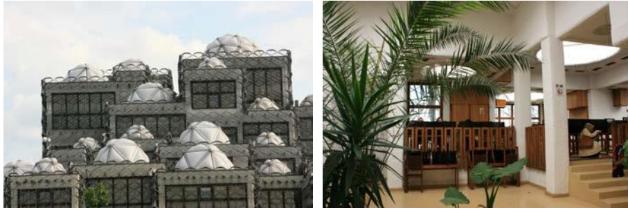
Fig. 8. Modern Architecture in Kosovo: National Library in Prishtina (author's photography in May 2015).

interesting platform for advice on this rather young architectural heritage field. Intensive exchange with Brazil, another focus point of modern architecture and important political factor within UNESCO, will be helpful, especially for issues of maintenance. We guarantee International attention and positive resonance on such a spectacular peace project in the field of cultural heritage.