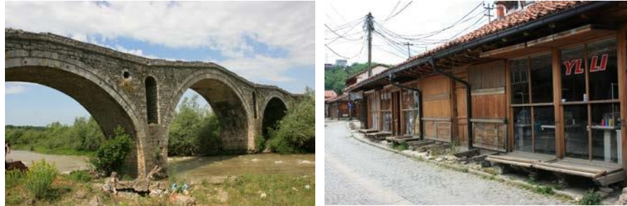
Fig. 6. Terzive (Tailors Guild) bridge on the way to and row of reconstructed wooden market stands within the market district of Gjakova (author's photography in March 2014 and May 2015).

Since 2008, there exists the ICOMOS Charter on Cultural Routes: The new concept ... shows the evolution of ideas with respect to the vision of cultural properties, as well as the growing importance of values related to their setting and territorial scale, and reveals the macrostructure of heritage on different levels. This concept introduces a model for a new ethics of conservation that considers these values as a common heritage that goes beyond national borders, It also helps to illustrate the contemporary social conception of cultural heritage values as a resource for sustainable social and economic development. ... Cultural Routes represent interactive, dynamic, and evolving processes of human intercultural links that reflect the rich diversity of the contributions of different peoples to cultural heritage. [10] With its so-called Saxonian mining towns (Novo Bërdo, Trepça and others), medieval silver mining centers of European dimension, which enabled the living together of mining and trading experts from different nations, religions and cultures, Kosovo provides a nice example for that new concept within the world heritage community.