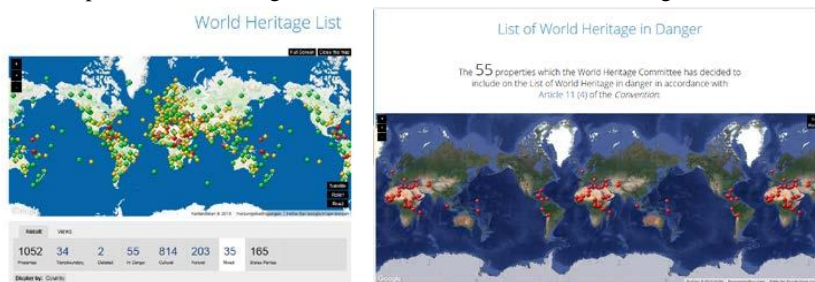
Fig. 1. The World Heritage List of UNESCO, left, and List of World Heritage in Danger with Medieval Monuments in Kosovo, right

In 1992, UNESCO established the WHC to act as the Secretariat and coordinator within UNESCO for all matters related to the Convention. The Centre is located in Paris and for the moment directed by the German Mechtild Rössler. The World Heritage Committee within UNESCO is the executive committee to decide annually about the listing of cultural and natural sites in the World Heritage List. If the condition of a particular world heritage is no longer according to its criteria, UNESCO deletes the monument, site or cultural landscape from its World Heritage List after various warnings from the WHC (“Heritage Alert”). The most prominent case within Europe is Dresden Elbe Valley, which fell from the list due to the building of a four-lane bridge (“Waldschlösschenbrücke”) in the heart of the cultural landscape in 2009. Nearly the same happened in Cologne when a spectacular museums’ project in the neighborhood of the dome won the international architectural competition. In that case, the city authorities chose to modify the architectural project under the guidelines of the ICOMOS expertise and so Cologne did not lose its status as world heritage site.