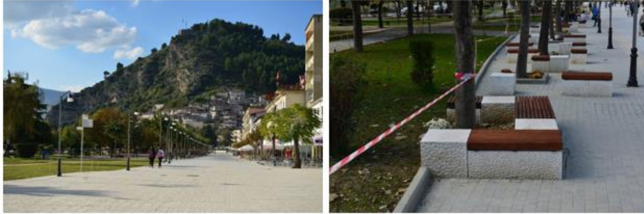
Fig. 5. Rehabilitation of the boulevard "Republika" and the "Teodor Muzaka" square

Osum River Island is a small with a very unique historical context being located near the historic center of Berat which is now part of the cultural heritage funds of UNESCO. The island itself is an area set aside and neglected by the city, but which nevertheless form the shape changes from time to time due to fluctuations of water in the bed of the river Osum. The strong presence of this asset in Berat makes us think that this island can truly transform and turn in the spotlight for the city, but especially for its surrounding areas. On the other hand, along their common history, the island and the water flowing on the banks of the river Osum, they have been constantly 'clash to determine their territories. Although the flood itself is not a new phenomenon, it again finds unprepared residents of areas that become a victim of its continuity as a result again we have a considerable inventory of damages and consequences.