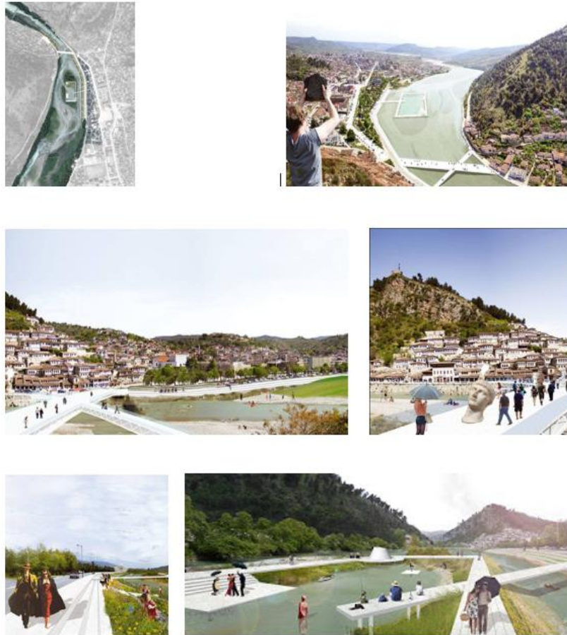
Fig.3. Some of the designed proposals of possible urban/architectural solutions for area of river flow “Osum”