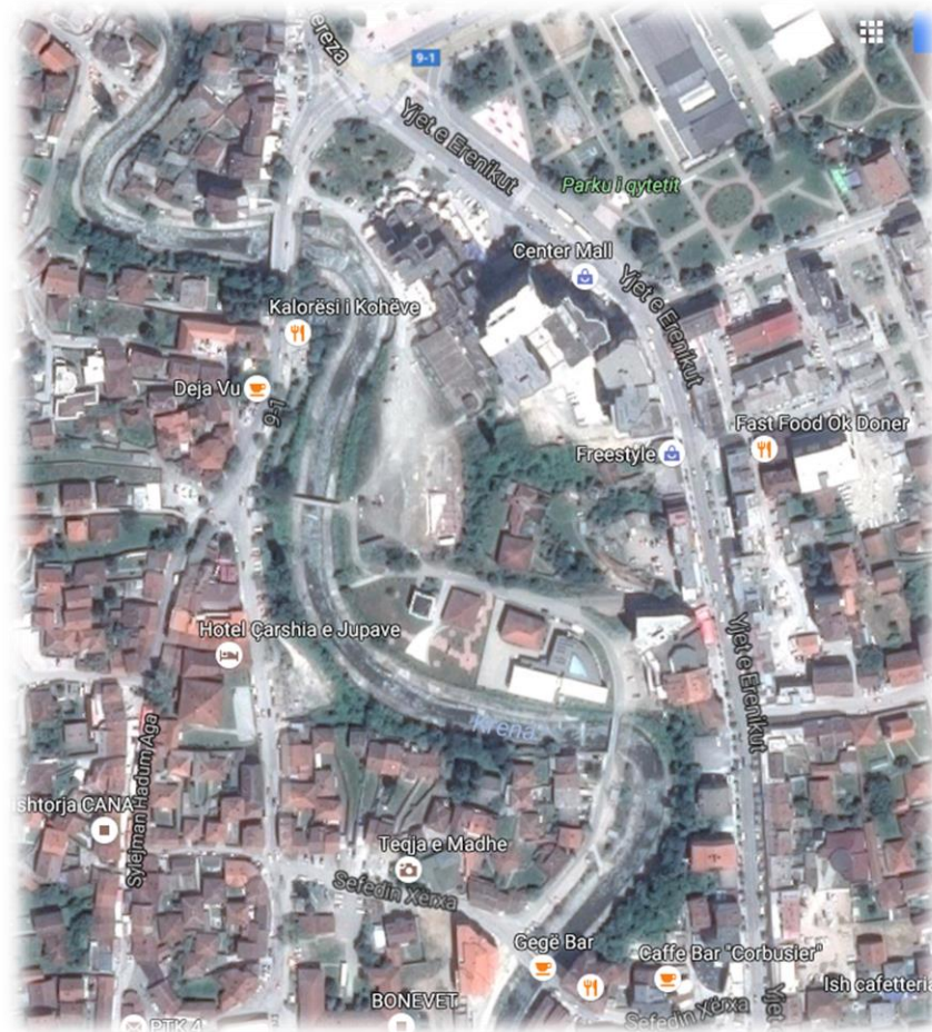
Fig.1. The position of treated segment of river “Krena” in Gjakova

The study work done (during May 2016), using comparative analyses and data’s from the field; also interviewing different groups of citizens (more than 300 direct interviews) in relation with their opinions about urban/architectural developments in this area based on their needs and requests. Collected data and information’s have been systemized, compared, evaluated and presented (as it can be seen at Fig.2). Some of questions raised during study work are: