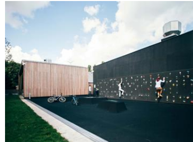
Fig.12 Proposal project "Adaptive reuse -Youth center"

Taking into account the urban extent in this area of Prishtina, which neighborhood includes 3 categories of urbanism (Low Housing, High Residential, Economic Zone and University Area), and in the absence of spaces and social facilities, the factory is meant to meet the needs of citizens as a social building without losing the values of industrial heritage.