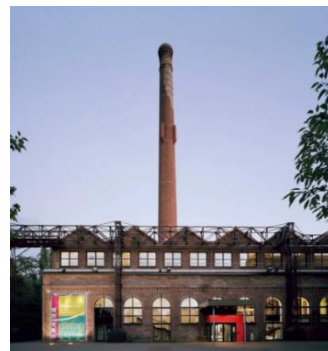
Fig 2 - After adaptation