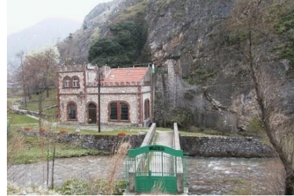
Fig.6-Museum of Hidro central Prizren

The other good example of revitalization is Museum of Hidro central Prizren Prizren's hydropower plant was the first to be built in Kosovo and started operating in 1929. It was built by an Austrian company to take advantage of the running river Lumbardh. The power plant has been active until 1973. In 1979 the building was approved to become a Kosovo Electric Museum, with exhibition rooms, a restaurant and a bar.