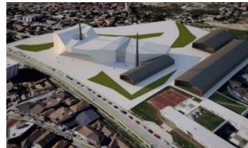
Fig.16 Adaptive reuse -museum and digital spaces