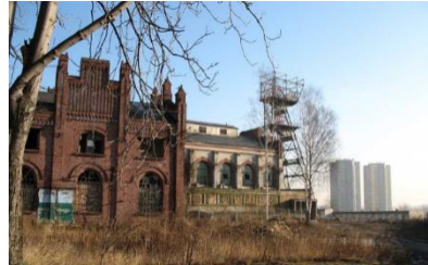
Fig.4 -Adaptation of the remaining post- industrial facilities of the former coal-mine.