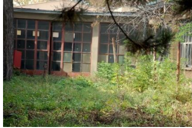
Fig.9- Existing situation