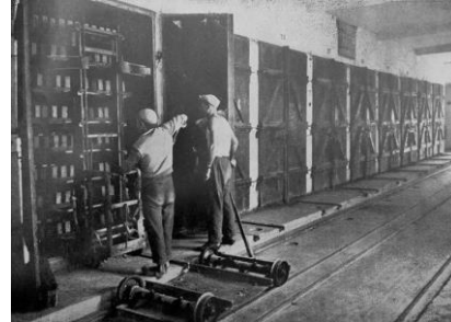
Fig.14 The old state of the factory-inside

Methods which are used in the research is quantitative method.