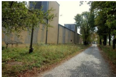
Fig.11 Existing situation

Preserving these industrial icons is an important part of maintaining the historic industrial character of a community. Changes in industrial practices have changed so dramatically in the last century that different regions have been prominent at different times and presently few regions dominate anymore as the industry has shifted globally.