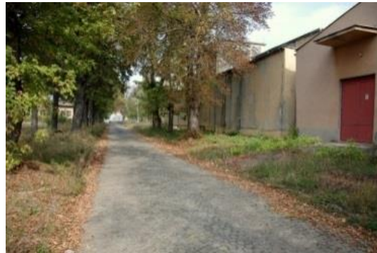
Fig.7.and Fig.8-Existing condition of factory

Factory 'Tjerrtorja' was identified in the 50s, known as the cotton and textile manufacturing factory.