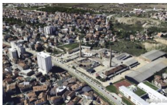
Fig.15 Existing situation

After the study and the results with the inhabitants of the area, as a proposal was given the preservation of 3 factory buildings, which have historical and architectural value for the city, the facilities are proposed for re-use as Modern Art Museum integrating and modern facility, while two chimneys will be a landmark, where they express the value of the buildings that have been constructed and at the same time restore the identity of this area of the city.