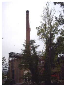
Fig 1- Before renewal

The objective of the project: urban integration