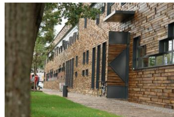
Fig 5 .-Television Klan Kosovo, 2014

As a good example of the revitalization of industrial facilities in Kosovo, is the factory of amortizes, which after privatization has been unworked, but is now rebuilt in the ambience and attractive location for everyone with its solution and re-utilization as private television and concert hall, where as a specialty of this area is urban regeneration and revitalization for the good of the community