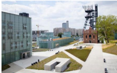
Fig.3 -Coal mine, before renewal

In 2015, the institution obtained its new head office in the modern complex of buildings in Katowice, ul. T. Dobrowolski 1.