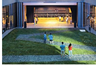
Fig.10- Adaptive reuse -proposal: "Theatre "

Preserving these industrial icons is an important part of maintaining the historic industrial character of a community. Changes in industrial practices have changed so dramatically in the last century that different regions have been prominent at different times and presently few regions dominate anymore as the industry has shifted globally.