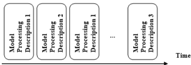
Fig. 1. Illustration of the sequential processing of different sub-model descriptions which performs in total the model processing of a certain system.

System simulation is based on the description of dynamic systems. The solution of this system are represented by a processing over time. Hybrid dynamic systems are represented by partitioned in different sections where the solution is computed from a sub-model description. This approach is illustrated in Figure 1.