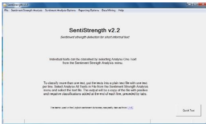
Figure. 1 Snapshot of SentiStrength v2.2

We compute the sentiment expressed by a blogger in his/her blog posts. We use a standard method for quantitative analysis of blog posts known as SentiStrength 2 . It is an opinion mining technique which identifies the sentiment associated with a word and assigns positive and negative scores. For that it uses a dictionary which categorizes the words into positive and negative just like a human being. The snapshot of the online tool of the SentiStrength is given in Figure 1.