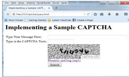
Fig 3. A simple Gimpy CAPTCHA coded with Python

website requests for a CAPTCHA, it sends a random string to the CAPTCHA server. The CAPTCHA server then calculates a password and returns the image in an encrypted format and the solution of the image to the user website