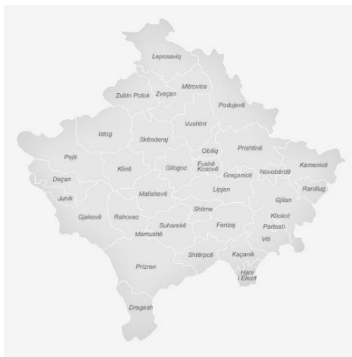
Fig.1. Map with the municipalities in the Republic of Kosovo

The process of local governance reform and the decentralisation was a very complex process and as such it required the adoption of numerous new laws, establishment of new municipalities and the revision of the existing ones, the reform of the local finance system and local capacity building for an effective self- governance. Therefore the basic legislation was adopted on local self-governance in the Republic of Kosovo as provided under the Comprehensive Status Proposal for Kosovo.