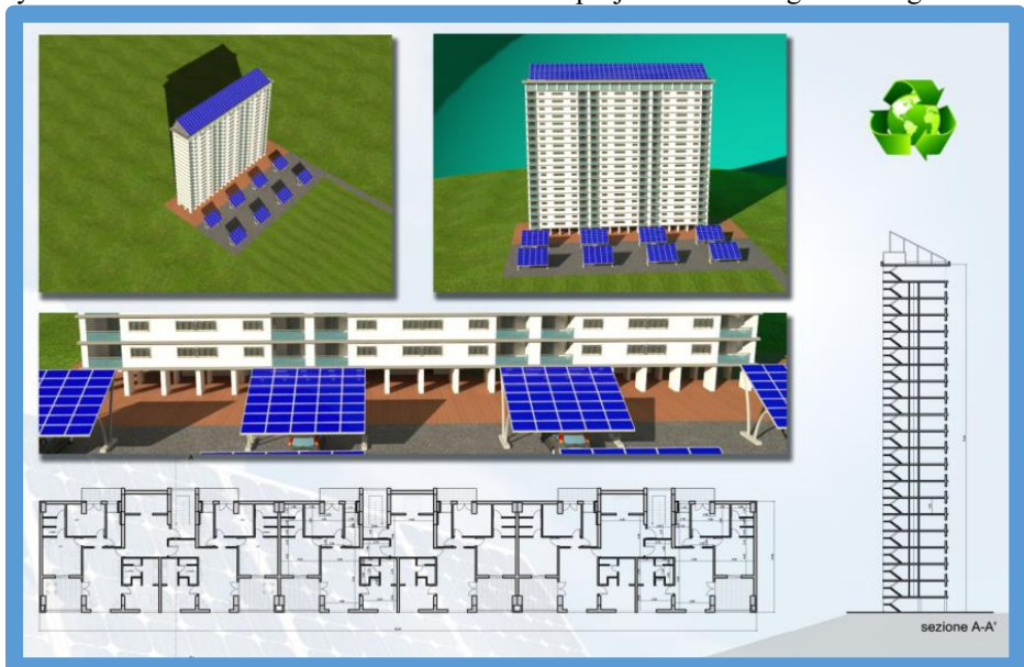
Figura 1. Excellence of Picoidraulica (mini hydraulic system)

This paper will describe the mini hydro and Pico Hydraulic technology, and how this system can be a considerable contribution in the projects of new high buildings.