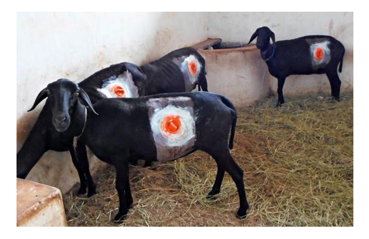
Figure 2. Ruminally cannulated sheep on the day after the surgery, following the application of repellent ointment around the cannula.

Immediately after surgery, antibiotic therapy was initiated using penicillin (Pentabiótico® Veterinário Reforçado, Fort Dodge Saúde Animal Ltda, Campinas, São Paulo, Brasil), at a dose of 30,000 IU/kg intramuscularly every 48 hours, a total of five applications. Furthermore, Flunixin meglumine (Flunixina Injetável, Uzinas Chimicas Brasileiras S. A., Jaboticabal, São Paulo, Brasil) was intramuscularly administered at a dose of 2 mg/kg, every 24 hours, for three days.