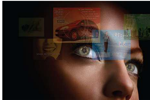
Fig 2: Virtual Display Image