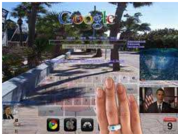
Fig 4: Computer Human Interface