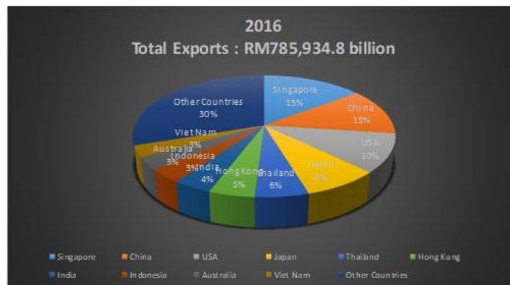
Figure 1. Malaysia's total exports