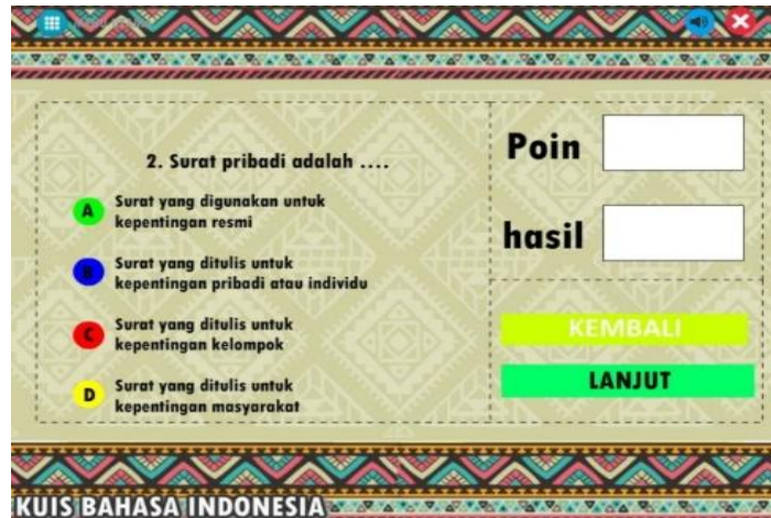
Figure 3. Source Addition, dan Image on reading cover