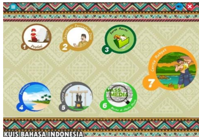
Figure 2. Display of the main menu after being revised

Validation results are used to improve/revise the assessment media (quiz) development. The results of the validation in the form of suggestions, among others from the material expert validator (1) improve the dots writing in the question; (2) add a list of difficult vocabulary words in the reading; (3) add the title above the reading; (4) include sources of images and text; (5) replacing news icons in the mass media; (5) and equalize the size of each theme icon. Suggestions from media expert validators (1) reading, layout, and font size should be equated to be consistent; (2) minimize the back and forth buttons and move their position down; (3) minimize the Points and Results box; and (4) adding pictures to the cover of the story. While the user validator recommends changing the reading theme buttons with more interesting icons so that the appearance of the media does not seem rigid. Here are some views of media assessment (quiz) based on Adobe Flash CC 2015 after being revised.