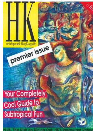
Fig. 1 First Issue in June 1991

The first issue of HK Magazine was published in June 1991 under the title HK: the indispensable Hong Kong Guide by Asia City Publishing Limited which was a private publishing company based in Hong Kong. (See Fig. 1) Apart from HK Magazine , Asia City Publishing Limited also published a portfolio of free lifestyle publications in the city including Where Hong Kong (an international travel magazine), Where Chinese (a magazine for Mainland China tourists), The List (a bi-weekly women's magazine), etc.