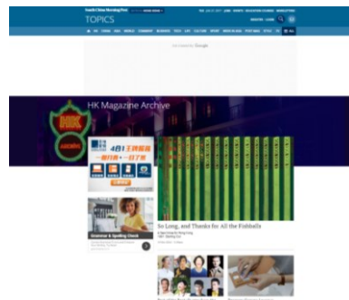
Fig.3 HK Magazine Archive hosted by SCMP Group

Being a highly popular and free English-language magazine, both the media profession and the public responded strongly to the decision to shut down HK Magazine . When the SCMP Group decided to cease publication of HK Magazine , the SCMP spokesperson said “[t]he last issue of HK Magazine will be published on 7 Oct, 2016 while the operations of its website and social media platforms will cease in a few days afterward.” (Anonymous 2016). It is hardly possible to imagine that a media publisher will consider deleting the content of its publication from its website even though the publication has ceased publication. This decision has caused a strong reaction from the Hong Kong Journalists Association to lodge an inquiry with SCMP management. In view of the enormous pressure and negative comments from the community, the SCMP Group finally decided that the online content of HK Magazine would be migrated to the SCMP website before the HK Magazine website was removed. (Grundy, 2016b). (See Fig. 3)