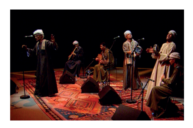
Figura 2 - Sheikh Ahmad Al-Tûni (Yesevi Order, from Egypt) Cité de la Musique, 14th of May 2004 (Paris, France)

towards a mosaic of oriental carpets situated in the centre and formed a semi-circle where they sat down. Right from the start of the recitation of poetic songs ( khassidas ), written by the Senegalese Sheikh Ahmadu Bamba (1853–1927) or Sérigne Tuba, as he is also known, the clear and harmonious voices of the Murids of Senegal, together with the simplicity, the elegance and the serenity with which they were delivered, impressed the audience, both visually and aurally, taking them to a collective state of contemplation.