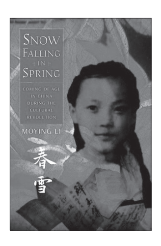
Snow Falling in Spring: Coming of Age in China during the Cultural Revolution

The Poet Slave is a nonfiction text that not only introduces poetic verse to the classroom but also brings to the student readers a history often neglected. By exploring Manzano's battle to shape his identity as a Cuban and as a poet against brutal injustices of slavery and racism, shared struggles are identified and cultural connections are made. Both students and educators will benefit from an examination of The Poet Slave of Cuba.