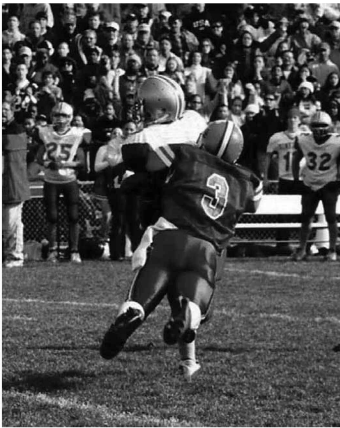
Figure 2. Initiating contact with the shoulder while keeping the head up reduces the risk of head and neck injuries.

down position and at risk of serious injury. Evidence Category: C