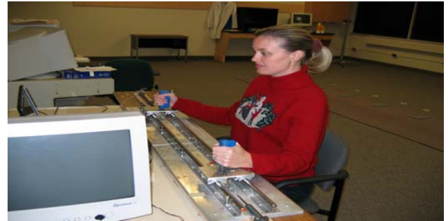
Fig. (1). Bimanual Linear Slide.

An auditory metronome (NCH Swift Sound Tone Generator, version 2.01) provided pacing information for the bimanual tasks. Under visual deprivation conditions, lights were extinguished and computer monitors were covered to achieve total darkness in the room, so that participants' view of their arms was completely eliminated. In auditory deprivation conditions, a white-noise masking stimulus (NCH Swift Sound Tone Generator, version 2.01) was delivered to the subject's ears via supra-aural headphones (Optimum Pro-155 stereo headphones) so that audition about performance from the linear slides was masked.