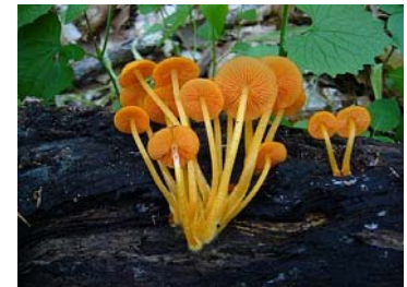
Golden Fairy Helmet