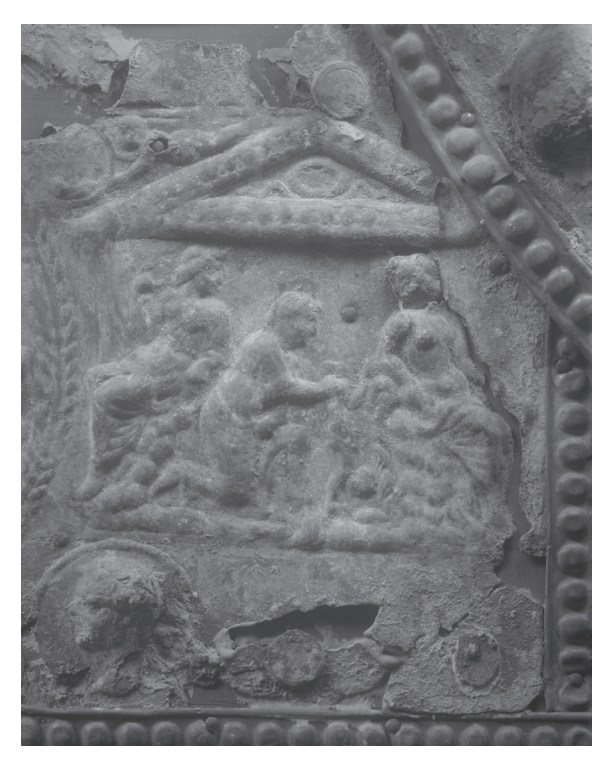
Fig. 16: Detail of Tensa Capitolina with Thetis and the infant Achilles accompanied by two semi-nude female figures (DAI-ROM 40.451)

of the smaller watercourses and tributaries of the Hieromykes. This is a minimalist result, but in the following, I argue for an identification of the nymph with Styx: In Graeco-Roman iconography, the personified depiction of Styx is very rare, but if depicted, then she is usually