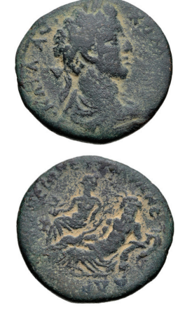
Fig. 12: Bronze coin of Adraa, Obv. Commodus, Rev. River god Hieromykes and Styx (Classical Numismatic Group, Electronic Auction 250, February 23, 2011, lot 283)