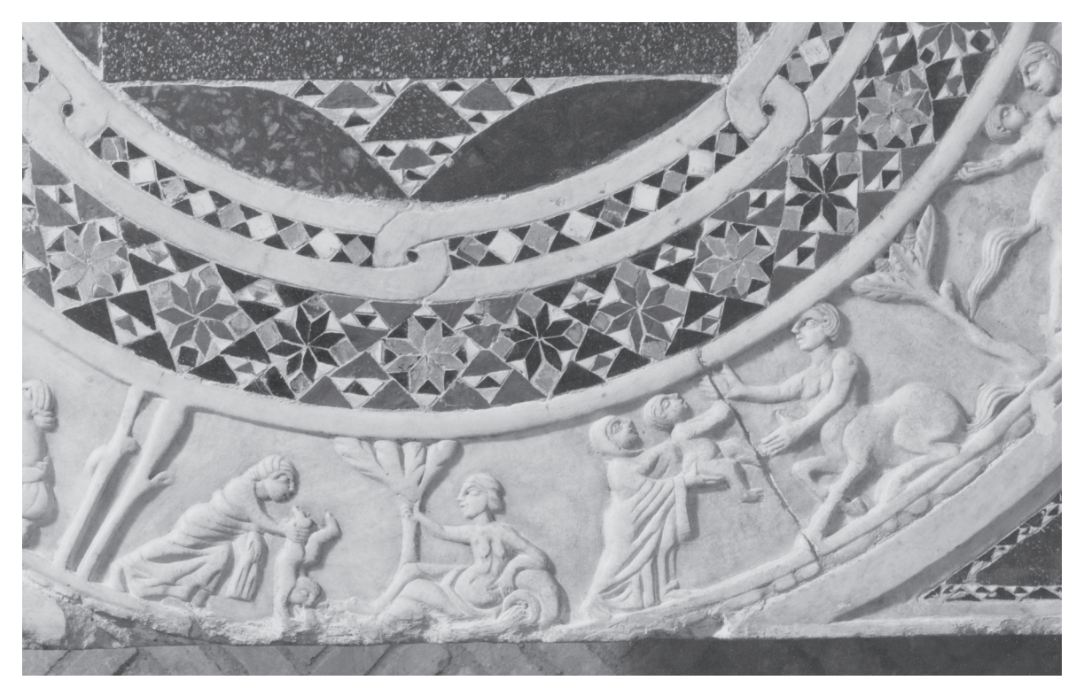
Fig. 18: Detail of table plate in Rome with Thetis and the infant Achilleus accompanied by two semi-nude female figures (DAI ROM 70.37)

re occurs on a late-antique table plate, again together with a tree (fig. 18)<sup>35</sup>. Although these images are later than the coin, the figure types are based on classical types and can serve as a comparison for an identification of such female figures as Styx.