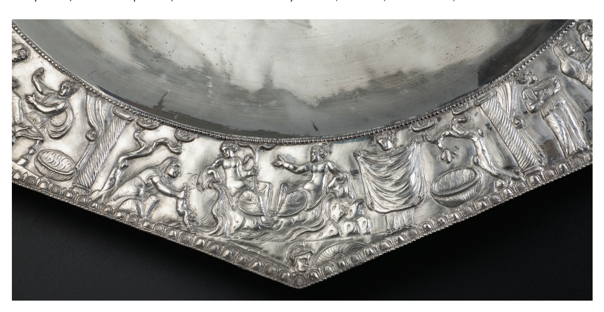
Fig. 17: Detail of Achilles plate from Kaiseraugst with Thetis and the infant Achilles with two reclining nymphs (one of them Styx) (Augusta Raurica)