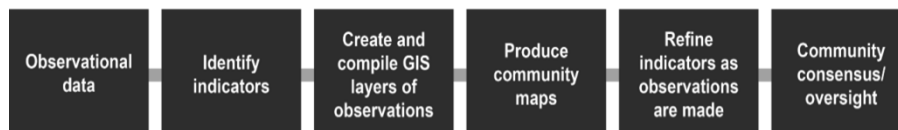
Figure 2. The process of co-development of a community-centered, regional early warning systems with end-user communities as potential first responders.

Incorporating CBONS into preparedness and response frameworks is necessary because it is unlikely that we, as a nation, will be able to equip and mount a centralized set of responses should arctic activity continue to increase at a moderate rate. Thus, incorporating CBONS into ACE can: (1) guide purposeful observations; (2) facilitate successful responses by Alaskan communities; and (3) inform more cost-effective planning and partnerships with local communities by state and federal agencies. This can be accomplished by: (1) helping manage data on observations of change; (2) integrating these data into critical event scenarios which bear realistic meaning to responding communities; and (3) combining engagement, workforce development, and better connections between communities and agencies. These elements enable responses to occur more quickly and effectively.