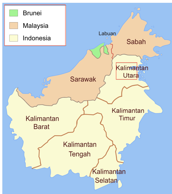
Figure 2. Map of Borneo

which they have close historical relations. While they speak the language of the group with which they have settled, the members of these sedentary groups do not typically speak Punan Tuvu'. With the spread of Indonesian as a national language, Kenyah and Punan speakers also communicate with neighboring populations in Indonesian. In certain official contexts Indonesian is also used between Punan speakers. Punan Tuvu' is classified as a separate branch belonging to the North-Sarawak subgroup. Figure 2 shows the approximate location where the languages discussed in this paper are spoken.