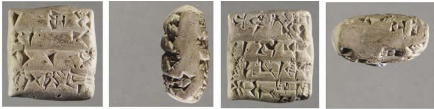
Tablet 1 (48mm × 37mm). Kress Collection (Helsinki).