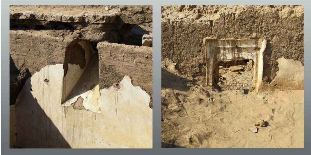
Fig. 15 - Interior and exterior view of a window