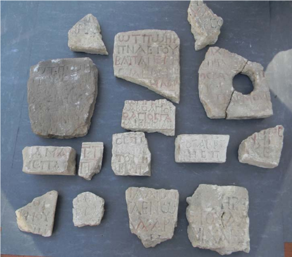
Fig. 1 - Stelae and fragments of stelae in Coptic