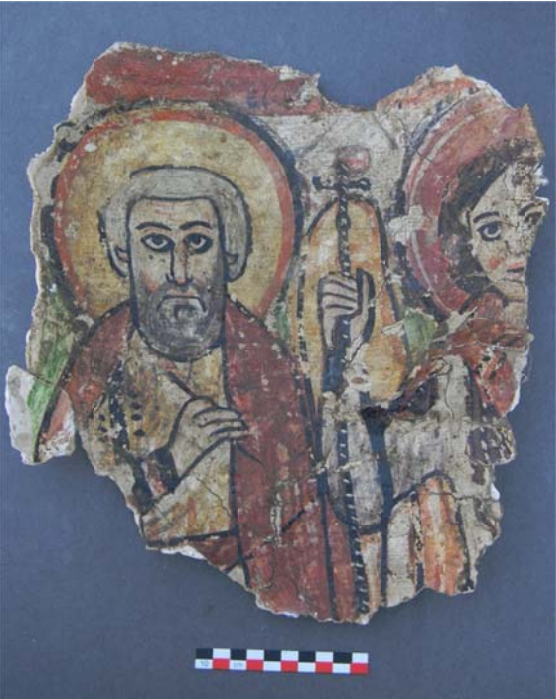
Fig. 6 - Figures of saints from one of the wall paintings