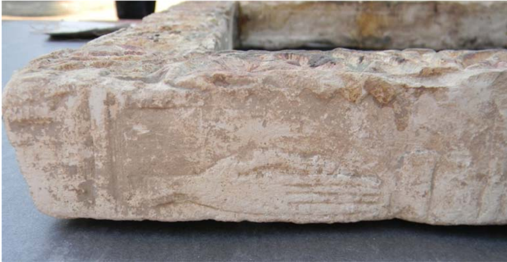
Fig. 3 - Hieroglyphic inscription on a block reused for a window frame (see below)