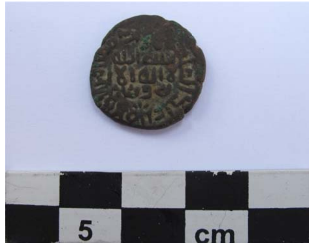
Fig. 8 - Bronze coin of the Abbasid period