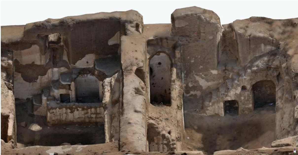
Fig. 10. Details of two housing units taken from the 3D model