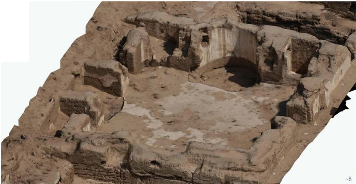
Fig. 11 - Perspective view of the small church obtained from the 3D model