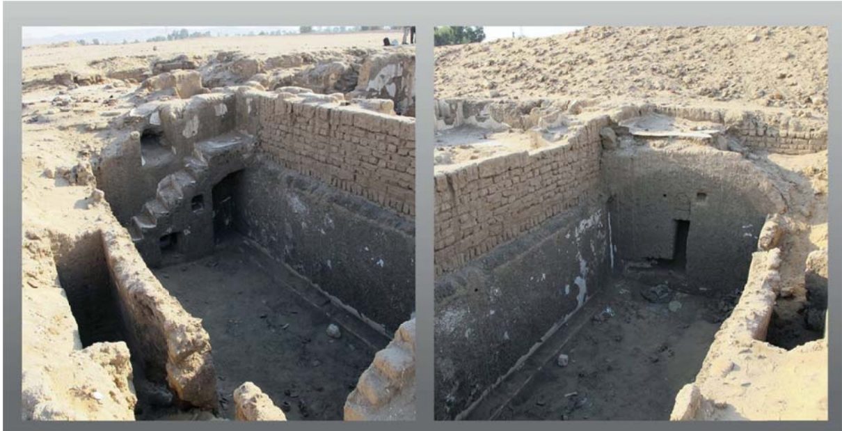
Fig. 12 - Two underground views of a Type 1 housing unit