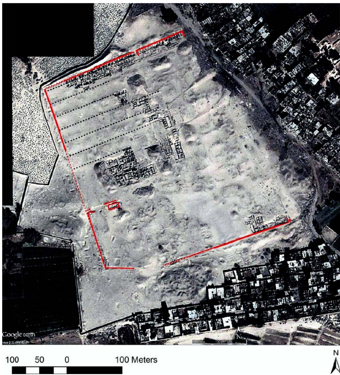
Fig. 9 - Plan of the site with the city walls (red line) and the alignments in the North-West sector (black dotted line)