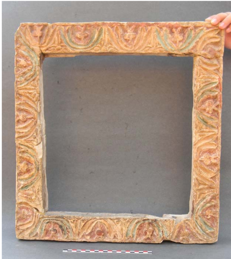
Fig. 4 - Window frame with hieroglyphic inscription (see above)