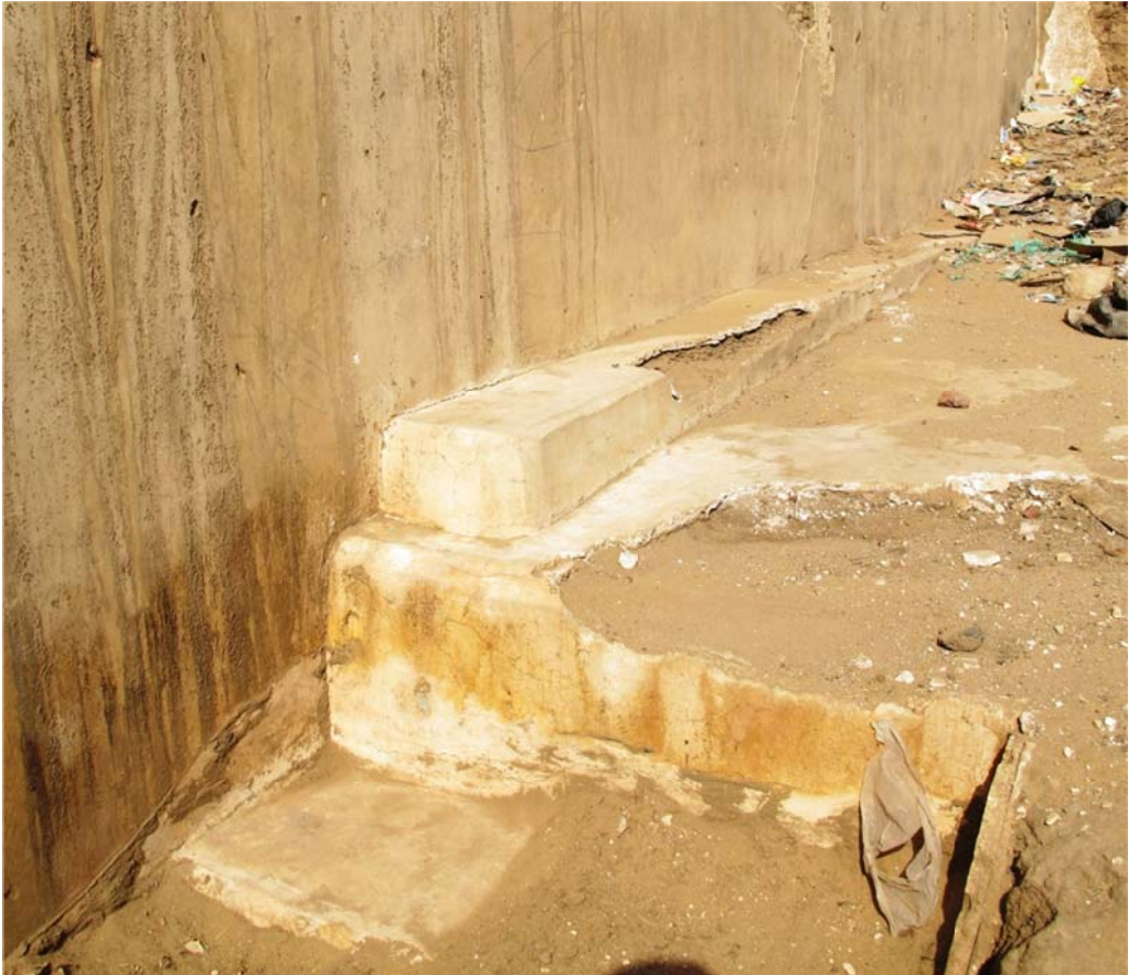
Fig. 14 - Example of white plaster lining