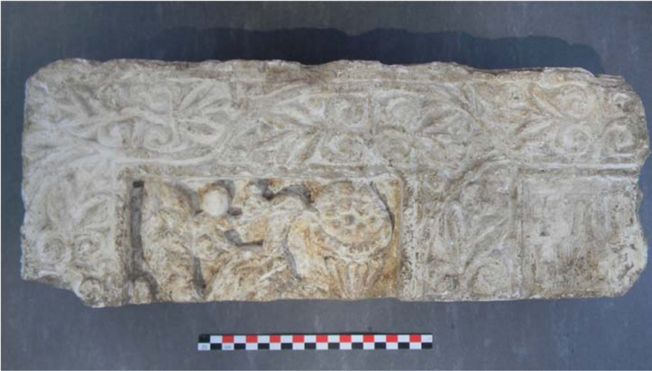
Fig. 2 - Architectural element with vegetal and human decoration and Coptic inscription