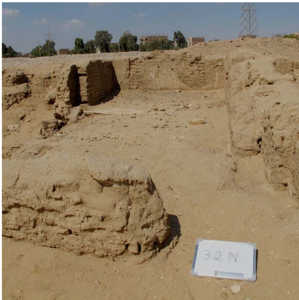
Fig. 13 - Example of a Type 3 housing unit