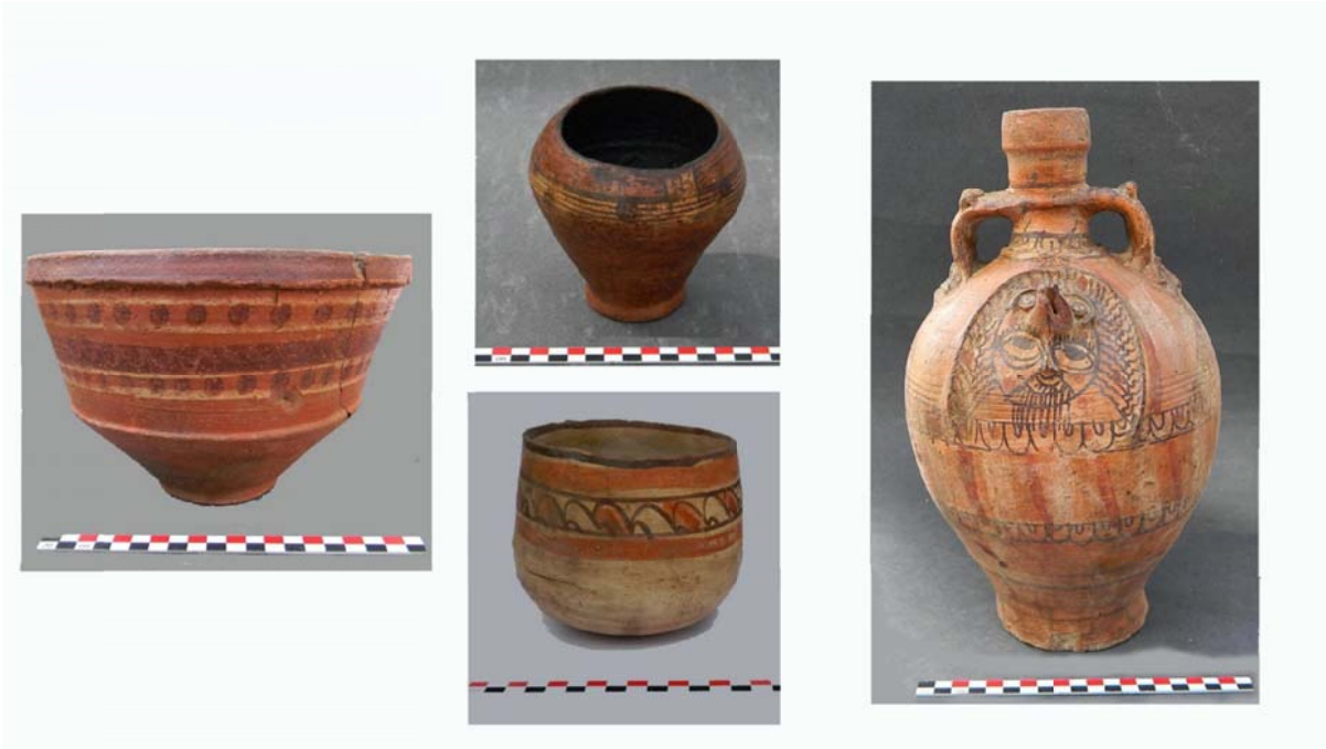
Fig. 5 - Some examples of decorated pottery