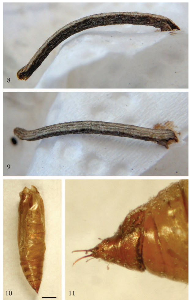
Fig. 8: Larva of Scopula ascensionis spec. nov., lateral view. – Fig. 9: Larva of Scopula ascensionis spec. nov., dorsal view. – Fig. 10: Exuviae of Scopula ascensionis spec. nov. – Fig. 11: Cremaster of pupa of Scopula ascensionis spec. nov.