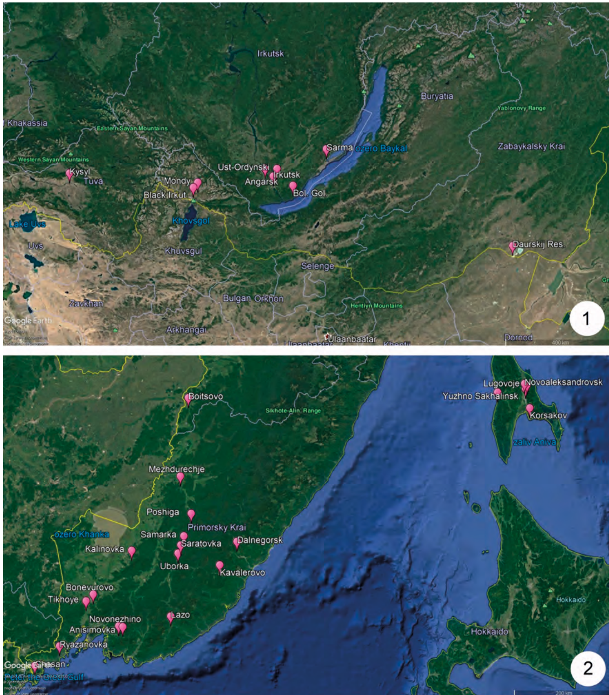
Fig. 1: Maps of collecting sites. Map 1: Collecting sites in Tuva, the Baikal area, Buryatia and Transbaikalia (Tchita Oblast). Map 2: Collecting sites in Primorye and Sakhalin.

SCHMID-EGGER, C. 2016: The Psenulus pallipes species group in Central Europe (Hymenoptera, Crabronidae). – Ampulex 8 : 40–44.