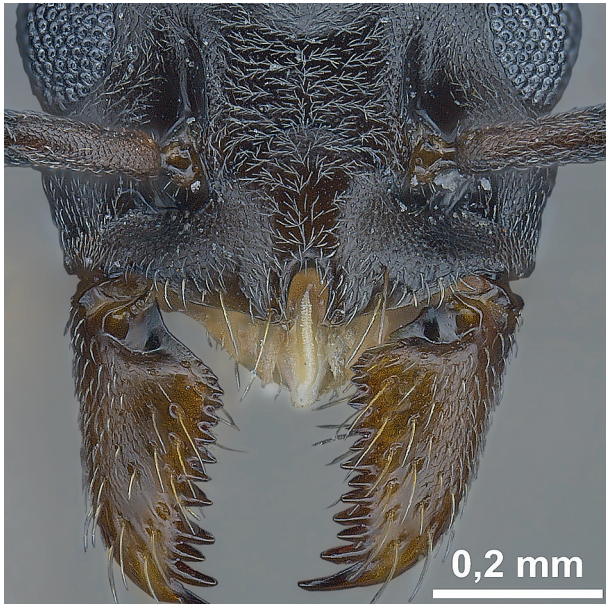
Fig. 2: Frontal head in a dry minor worker of Tapinoma magnum MAYR. The fitting of the glossa into the clypeal cleft shows a situation expected in an initial phase of dorsofrontal protrusion of mouthparts.