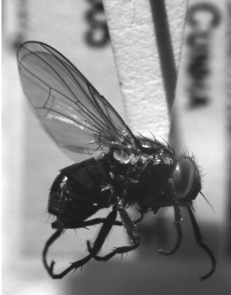
Fig. 3: A Lesser Housefly, Fannia albitarsis STEIN, 1911. A lateral view of the female specimen collected from the potato patches on Tristan da Cunha in 2005.

As with C. trina and the other three species, the occurrence for the first time of Fannia albitarsis STEIN on the archipelago can be attributed to an introduction by unnatural means. This could have been from South Africa, but its exact distribution there is not known and, on the face of it, the most probable point of origin seems to have been its original home in the south of South America, perhaps via the sealers.