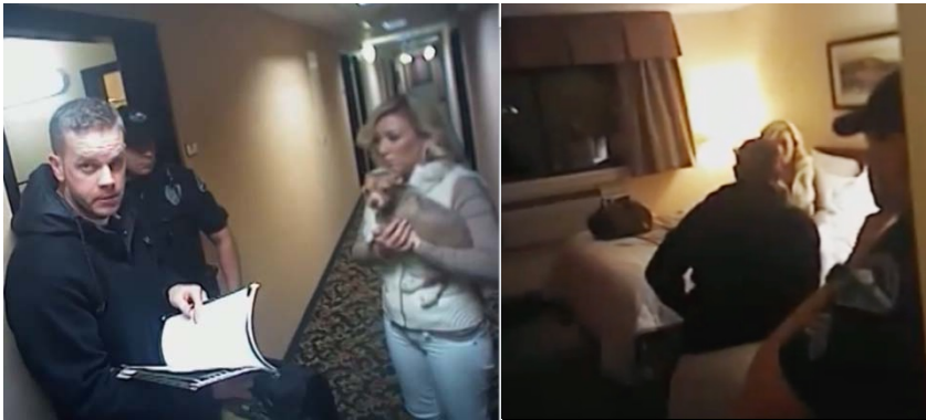
Police investigation in a bedroom publicly disclosed on YouTube. 1