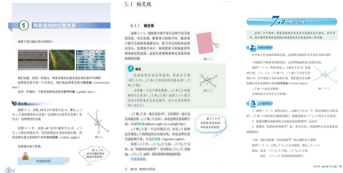
Figure 2. Textbook comparison

arrangement, problem situation, sample exercises, expansion and extension. As shown in figure 2, the knowledge introduction forms of "intersecting lines" in the three editions of textbooks are all different. For example, common life examples are used to arouse students' resonance to "intersecting lines", operation activities are used to let students discover the origin of "intersecting lines", and definition of "intersecting lines" is obtained through observation model. Under the educational background of "multi-edition with a common aim", teachers should not limit themselves to one edition of textbooks, but learn from other editions with an open mind to achieve "teaching with textbooks" instead of "teaching textbooks".