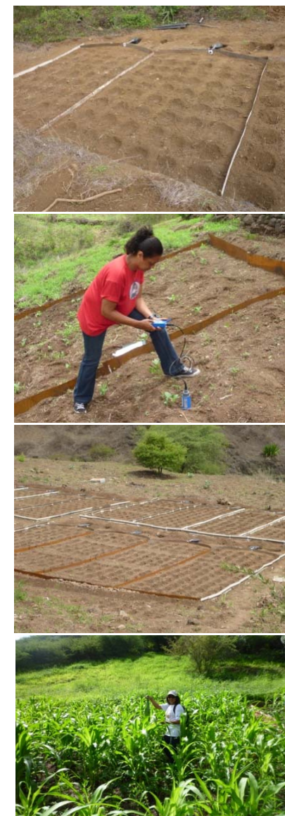
Figure 2: Aspects of trial sites

*Treatment means followed by same letters are not significantly different at 0.05 level