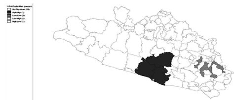
Figure 2 shows the violence index of 1999 and 2014, which is used to analyze the spatial agglomeration of insecurity. What we find is that the high-high growth of insecurity occurred in the municipalities of Acapulco de Juárez, Coyuca de Benítez and Chilpancingo de Los Bravos (darker-upper color), while in 2014 there were only two municipalities that were belonging to a violent cluster /o cluster of violence.