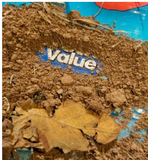
Figure 2. Organic sculpture image entitled “Value” amidst garbage.