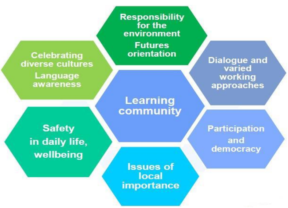
Figure 3. Finland's vision for schooling, 2015.

Their conception of learning emphasizes self-regulated, active, and lifelong learning, and includes the importance of ethics and aesthetics to support the growth of the whole child for full development as a person and citizen. This is also reflected in their new curriculum, which now includes a "mudi," or multidisciplinary learning module, that each school selects for the year; the students participate in the planning of the project.