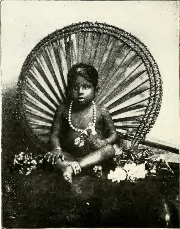
See "MOTHERHOOD IN INDIA"