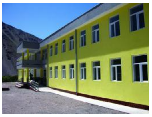
Shown Above: A new girl's school at Bazarak has 16 classrooms and will teach more than 400 students. There are numerous schools being built in the valley to help educate the children in the Pansjhir.

A ribbon cutting ceremony to commemorate the opening of a girls' school with 16 classrooms was held. The school will hold approximately 400 students in three shifts.