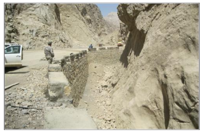
Above: The road project linking Parwan and Bamiyan Provinces is a seven-phase process with hopes of improving economical stability

U.S. Forces Afghanistan has Civil Affairs personnel operating all over the country. Below are two good news stories from Regional Command-East