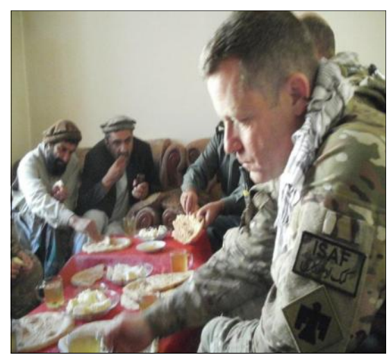
Left: PRT-Pansjhir conducts a Key Leader Engagement with local Governor.