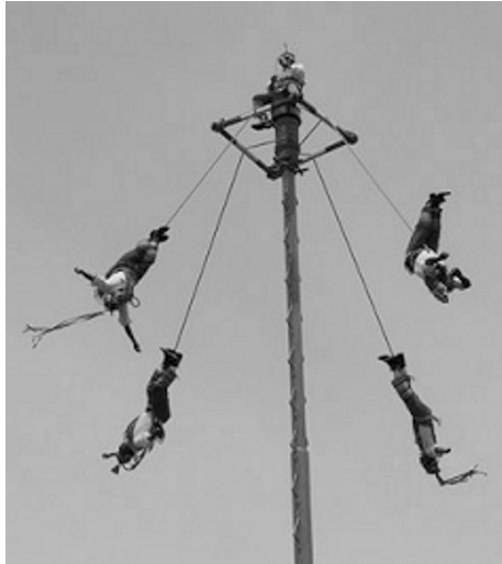
Fig. 4. Los Voladores de Paplanta .

“Vanishing point” also refers to the ambiguities between real and unreal characters/objects—some of whom exist in virtual reality only (film and closed circuit video are used to trigger flashbacks, and elicit responses caused by these memories; there is also use made of surveillance cameras, cellular phones, as well as audio recordings and voice traces)—and to floating/disappearing kinetic objects in the back of the stage, objects that flourish only in that midnight reality that shields them from our view. Particular use is made generally of the symbolic objects/props mentioned in the script (photographs, postcards, airplanes, escapulario , aviator equipment, plastic bag with remains, etc.), and of the “official” items of evidence used by Officer Lauder who appears to chloroform their facticity, pinning them down like the exterminated moths in a child’s collection.