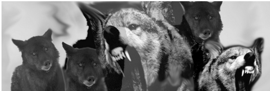
Fig. 7. Puntos de Fuga, Wolfmodel screen image.

4. PHYSICAL SPACES —Stage character moves with filmic depiction of physical space (remote location, fantastic/fictional space).