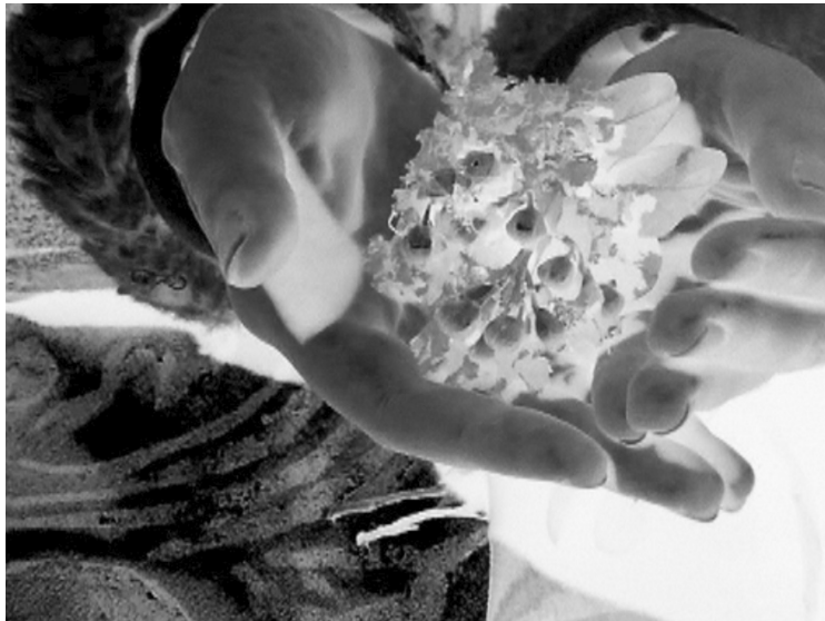
Fig.8. Virgen del Carmen model.