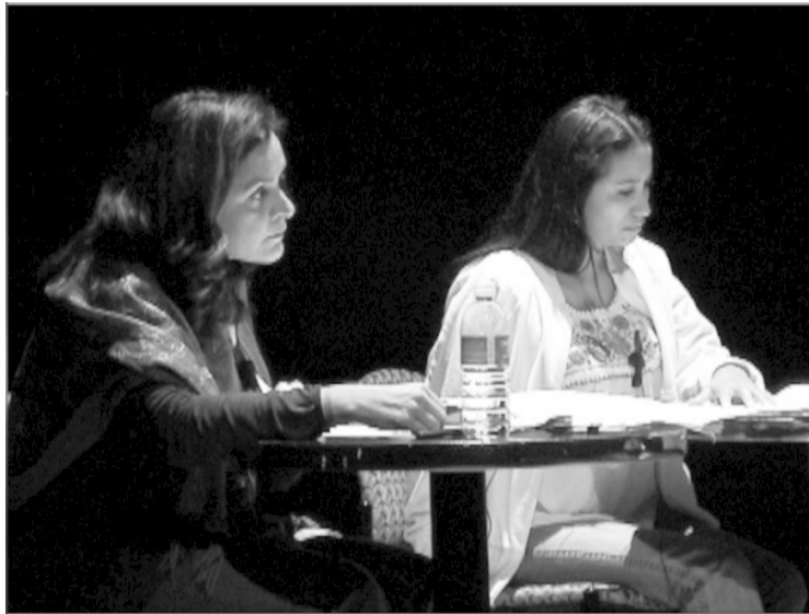
Fig. 9. Puntos de Fuga , stage reading, Talento Bilingüe de Houston , 2007. Videostill: D. Ezquenazi

camera-interaction, i.e. the actors need to understand the significance of performing in a telepresence environment where the camera is the interface between performance choreography and technology. It is the base line of a journey into relationships between visual/kinesthetic forms and digital outputs. It is an important starting point for digital performance to embrace the camera as a recording and motion tracking instrument, to explore its possibilities/limitations, to understand how it selects and describes, and to place it within our physical work, not outside it. It helps to remember that the camera can do what a live performer cannot, namely generate extreme close ups, remove the context, shift gravity, record and use digital effects and in-camera-editing.