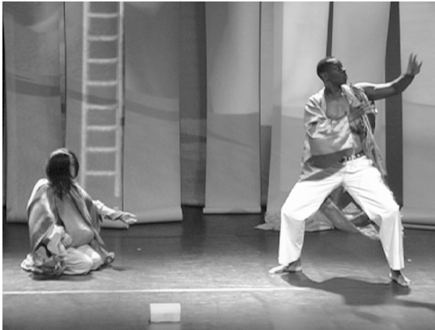
Fig. 1. Scene from Suna no Onna , Laban Centre Theatre, 8 December, 2007.

Nor is it possible as yet to claim that interactive theater involving the audience as co-producers is likely to be implanted anywhere soon: the interface design for unsuspecting and untrained audiences asked to step inside and make use of new interactive performance techniques has not been cre-