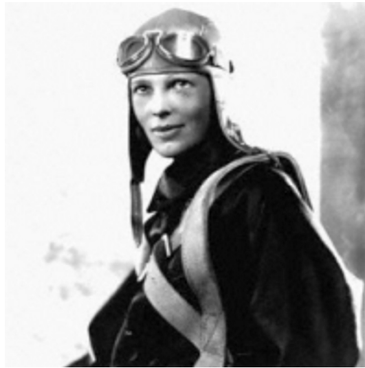
Fig. 6. Amelia Earhart, archival photo.

[ACT 1, SCENE 2 Lights on Marina. She is alone, standing on the right side of the wall mirror. As she speaks to her reflection, she gives her back to the audience. The mirror is not actually a mirror; its reflection is simulated by the projection of the camera capturing her live action on stage. Her face is bruised. With a tissue paper she gently wipes the blood coming out of her nose. She then examines a broken rope in the shape of a noose and talks to her reflection. ON SCREEN Live video feed gives the illusion of Marina's frontside mirror reflection. She insults herself. CROSS-DISSOLVE into film sequence: AMELIA EARHART tying her aviator scarf in the shape of a noose. She smiles playfully. Places scarf around her neck and lowers her aviator goggles to her eyes. The camera shot opens as it pulls back to reveal her standing on a fashion runway. She walks down the runway displaying her aviator suit as a super model would. She then slowly extends her arms out like the wings of a plane and lifts off, exiting the frame. Next shot is a CU on her face as the wind hits it. This shot will be underscored with Marina's voice.]