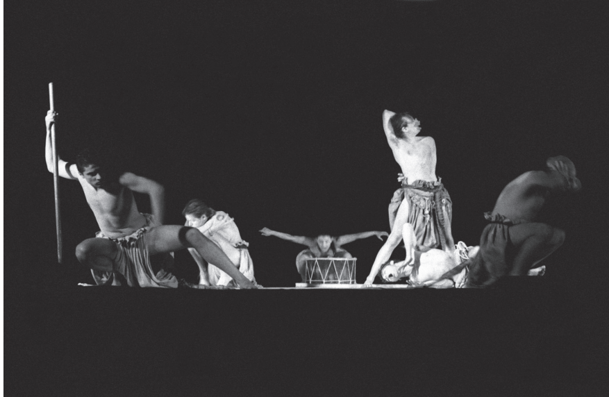
Bacchae, one of the earliest and most celebrated productions of Attis (1986). Directed by Theodoros Terzopoulos.

developing new artistic and religious feelings and paradigms? Is tragedy not one of the stable structures in our Western life and imagination that needs to be questioned in its deepest conditionings? Did not tragedy as a mental category, which organizes our thoughts, fears, and emotions, alienate us from nature and didn't it partially atrophy our senses? Isn't it time, facing the deep spiritual and other crises we go through, to (re)win a fuller body than the one we were raised with, one that is teeming with life, but was so often neglected? Painful questions like these focus more on heterogeneous than on monolithic worlds, more on continuous processes than on definite products, more on worlds in continuous phases of becoming rather than on a situation of perennial being and unmodified Form. Terzopoulos led us to discover aspects of Otherness, other possible bodies, energies, and vibrations. He questioned the traditional ideal of continuous progress and the longing for one dominant ideology, and his recently repeated warnings in Prometheus : "The day will come," had a very explicit political colour.